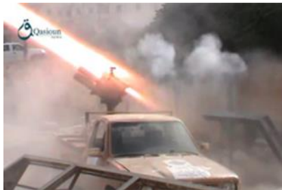
The Sham Legion is a group of 19 Islamist rebel groups in Syria.