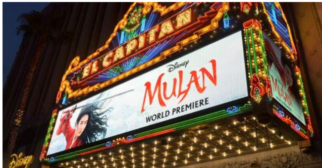
Disney filmed the live-action version of "Mulan" in Xinjiang, China, where Uighur people have reportedly been imprisoned. Pictured: The Dolby Theatre March 9, 2020, during the world premiere of "Mulan" in Hollywood.

in a column Monday. "Why did Disney need to